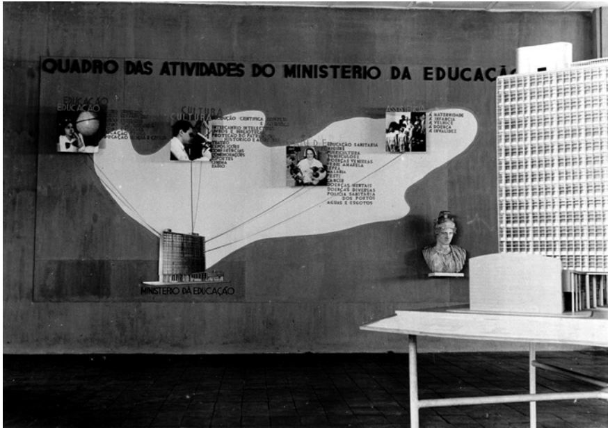
FIGURE 2 Diagram of the activities of the Ministry of Education and Health. The modernist project for the headquarters of the ministry appears underneath this as a photo, and on the right of the image, as a maquette (1938).