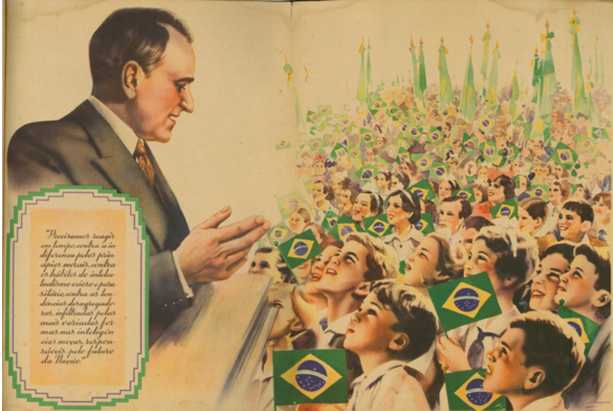
FIGURE 1 Vargas and Brazilian youth such as presented in The Booklet of Youth (A Cartilha da Juventude), published by DIP (1941).

‘in line with’ the objectives of the State, and was ‘certain’ in its message, namely committed to the greater task of contributing to the construction of the nation in the terms defined by the state ideologues. 43 A sophisticated example of the mythical discourse in which Vargas’s action in the cultural field was expressed is Getúlio Vargas’s Getúlio Vargas e a arte no Brasil [Getúlio Vargas and Art in Brazil], written by Oswaldo Teixeira, director of the National Museum of Fine Arts, and published by DIP in 1940. The hyperbolic tone is already suggested in the book’s subtitle: ‘The direct influence of the heads of state in the artistic formation of the homelands’. It offers an account of the place which Vargas occupies in the epic history of the role of benefactors in the production of great art. Moving from Pericles in Greece to Augustus in Imperial Rome; from the Renaissance of the Medici to the France of Francisco I and to Spain under the governments of Felipe II and Felipe IV, the narrative continues in a crescendo to culminate in the Estado Novo, which is thus compared directly with the glorious epochs of the western art. In Teixeira’s account, Vargas and his regime were in the process of endowing the country with the material and spiritual conditions for a new dawn of the arts. Not only had the chief of the nation instituted a favorable environment for the artists and their work, he personified