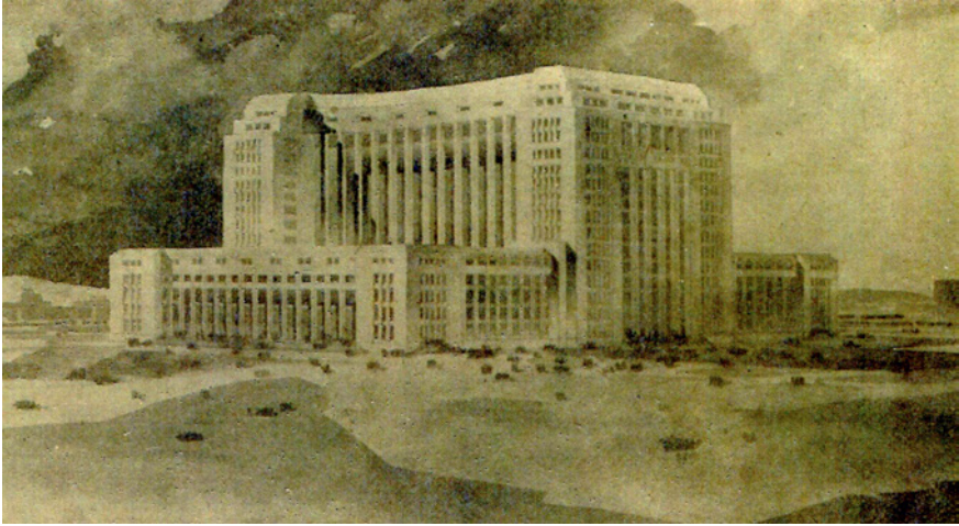
FIGURE 4 Unrealized project for the Palácio da Justiça in an eclectic blend of stripped classical and monumental modernist styles.