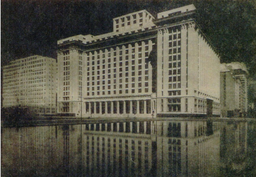
FIGURE 3 The Palácio do Trabalho building in stripped classical style, and, on the left, the headquarters of the Ministry of Finance (1944).

SOURCE: REVISTA DO SERVIÇO PÚBLICO 3 (1944).